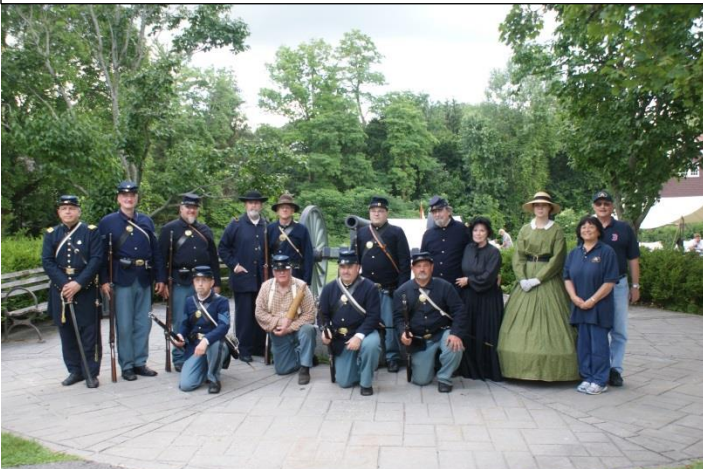
Members of Company F 14 th Connecticut Volunteer Infantry at a living history in Lennox, Massachusetts, July 2017.